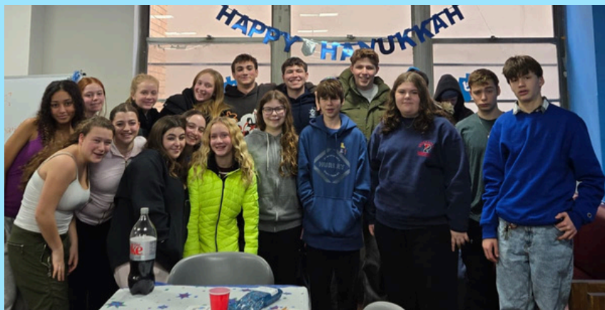
FHJC teens gathered to celebrate at the USY Hanukkah Party.