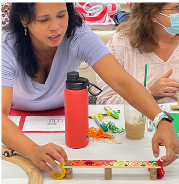
FHJC Nursery & Pre-K teachers gathered to prepare for the year ahead.